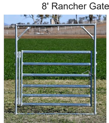
8' Rancher Gate