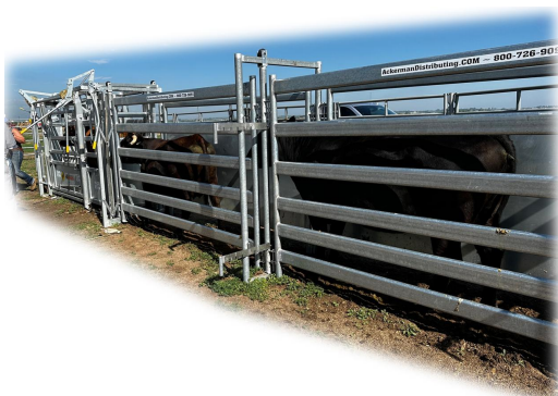
Sheeted & Open Adjustable Alley