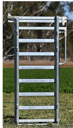
Auto Lock Slide Gate