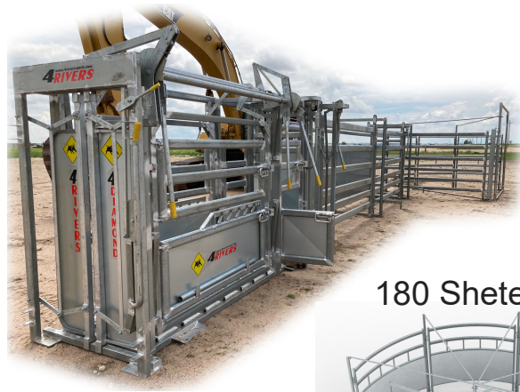
180 Sheted Tub